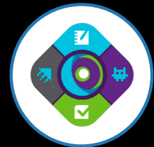
SMART SLS ONLINE SOFTWARE