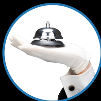
WHITE GLOVE SERVICE