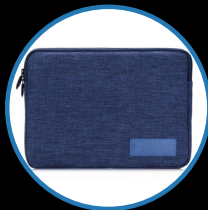
NUTKASE PROTECTIVE COVERS