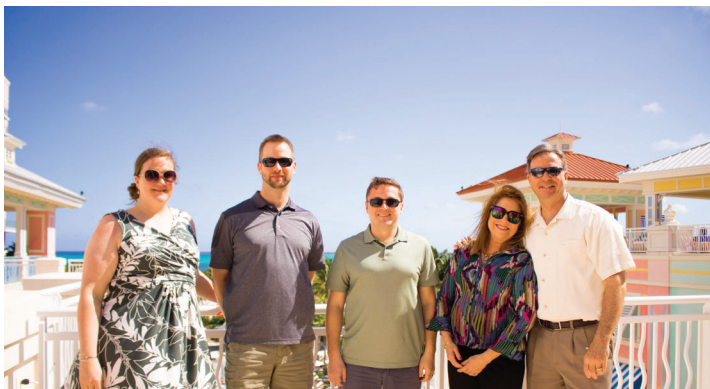
CCS NEW ENGLAND